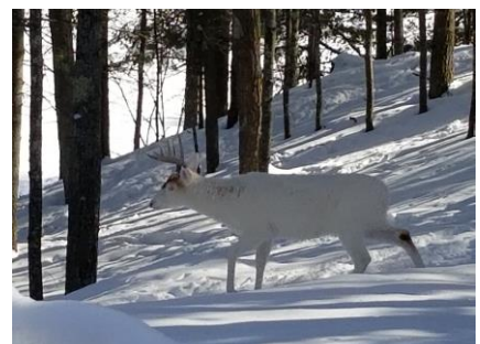
White 8 point buck with brown head.