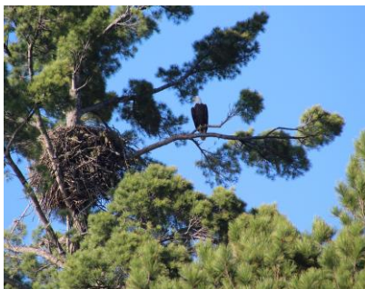
Eagles Nest.

Albino and White Bucks: Our albino buck is beautiful and very majestic and there is also a white buck with brown markings on his head. I hope you all get the opportunity to see each of them.