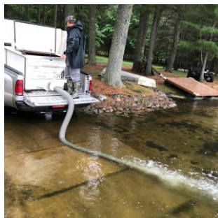
Walleye Stocking June 22, 2018.