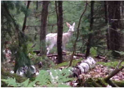
Albino fawn seen on Shields Road Picture taken by Ann Waisbrot on August 18, 2014