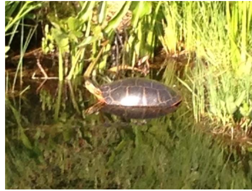
Newly hatched turtle on Moon Lake Picture taken by Ann Waisbrot on June 9, 2014