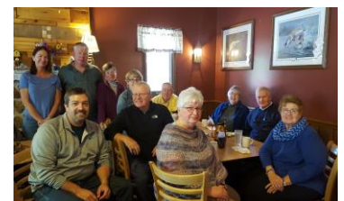
Breakfast Social at the 3C's