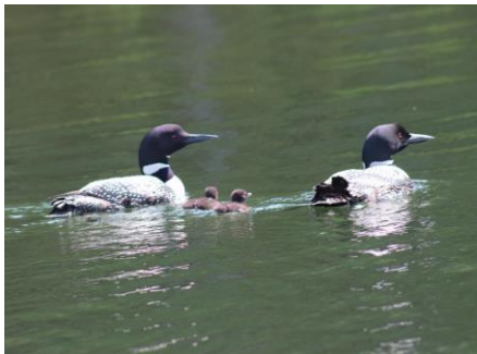
Loon Family.

Loons and Eagles: Our Loons had two hatchings this year and our Eagles had one eaglet.