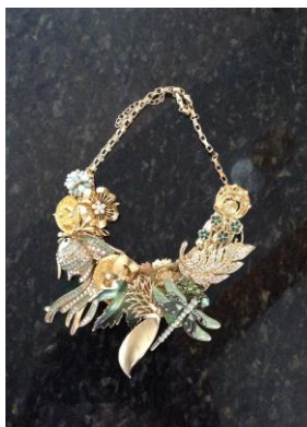
Kris's First Place Necklace