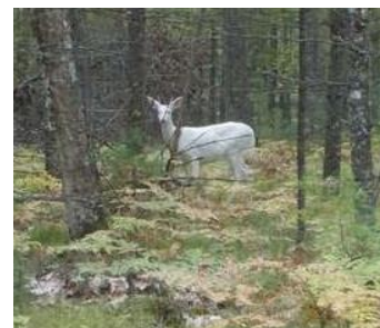
White Buck.