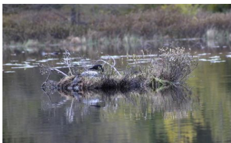
Nesting Loons.

Loons and Eagles: Our Loons had one hatching this year. No information of Eagles nesting.