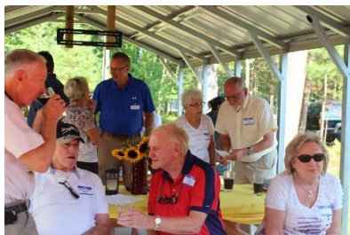
BBQ at the New Twilight Bar and Grill