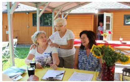
BBQ at the New Twilight Bar and Grill