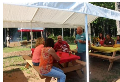
BBQ at the New Twilight Bar and Grill